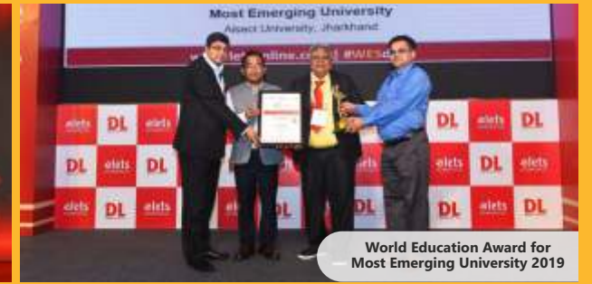
World Education Award for Most Emerging University 2019