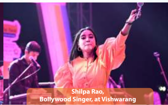
Shilpa Rao, Bollywood Singer, at Vishwarang