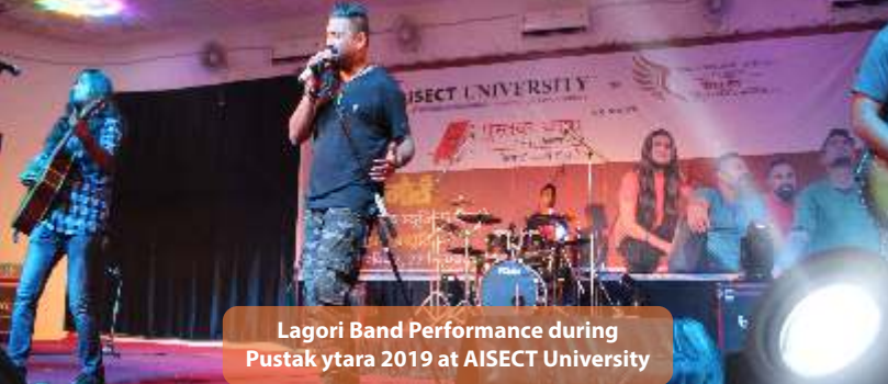
Lagori Band Performance during Pustak yatra 2019 at AISECT University