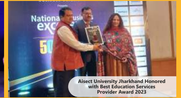
Aisect University Jharkhand Honored with Best Education Services Provider Award 2023