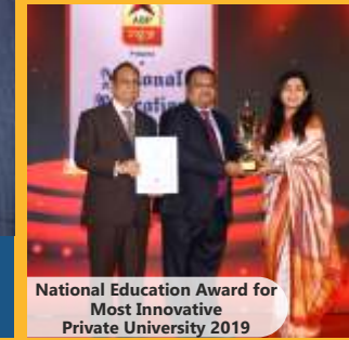
National Education Award for Most Innovative Private University 2019