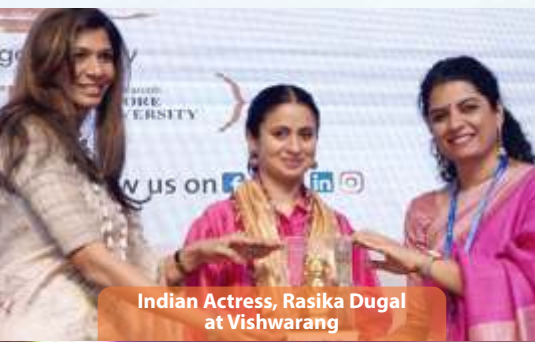
Indian Actress, Rasika Dugal at Vishwarang