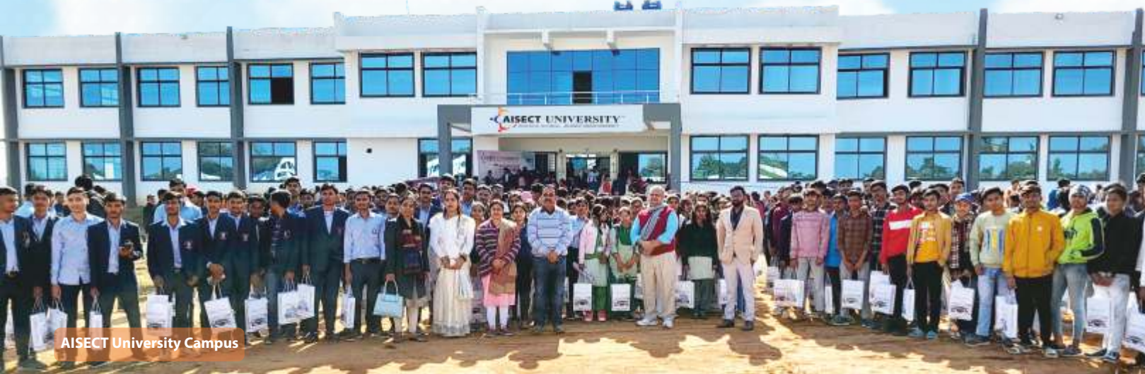
AISECT University Campus