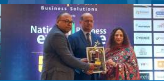
Awarded with the National