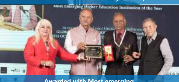
Awarded with Most emerging University of India Award 2023